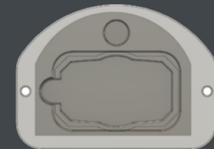
Overlay of cutout and holder